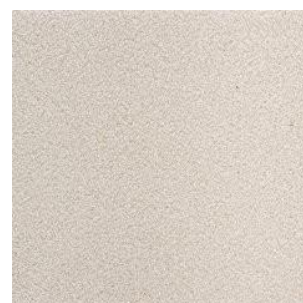
SATINE REVELATION 305