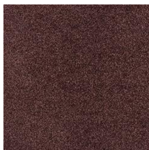
SATINE REVELATION 773