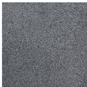
SATINE REVELATION 150