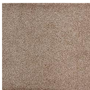
SATINE REVELATION 312