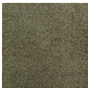
SATINE REVELATION 229