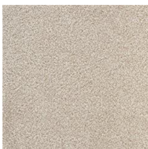
SATINE REVELATION 307