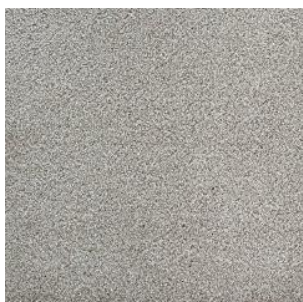
SATINE REVELATION 139