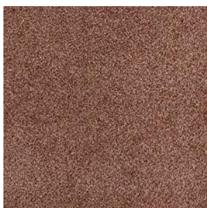
SATINE REVELATION 510