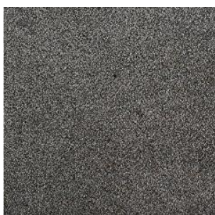
SATINE REVELATION 160