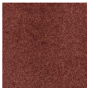
SATINE REVELATION 777