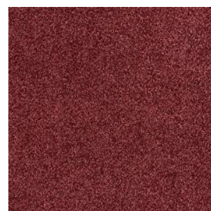
SATINE REVELATION 455