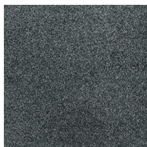
SATINE REVELATION 240