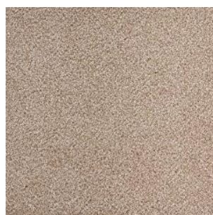
SATINE REVELATION 331