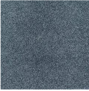
SATINE REVELATION 891