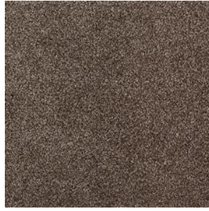
SATINE REVELATION 989