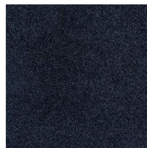
SATINE REVELATION 828