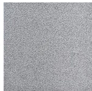
SATINE REVELATION 154